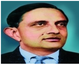
Dr. Vikram A. Sarabhai