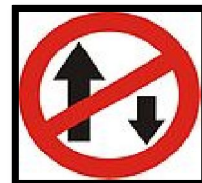
One way sign